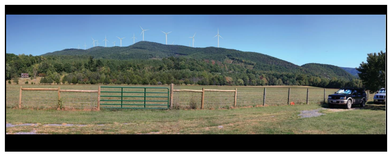
This computer simulation from Apex Clean Energy shows what the Rocky Forge Wind Farm would look like from a residence 1.1 miles away.

If gigantic wind turbines are built atop a Botetourt County mountain, the impact will be far more sweeping than the reach of spinning blades nearly the length of a football field.