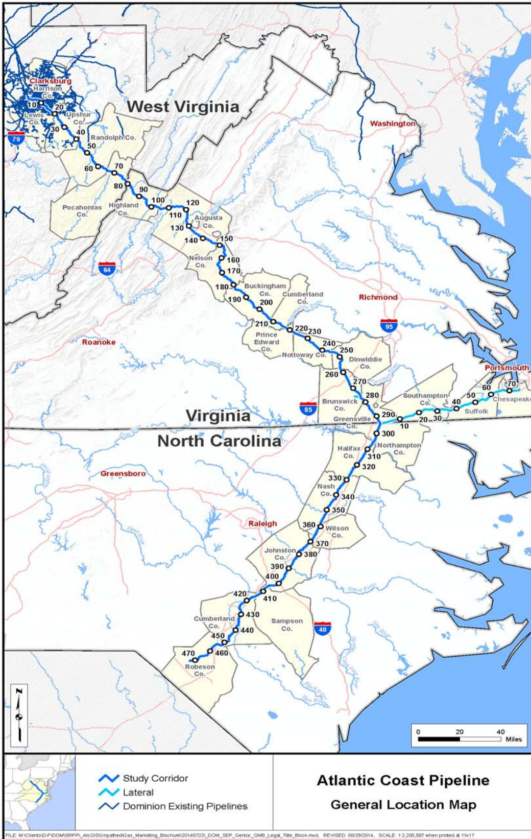
Figure 2.1: Map of the Atlantic Coast Pipeline