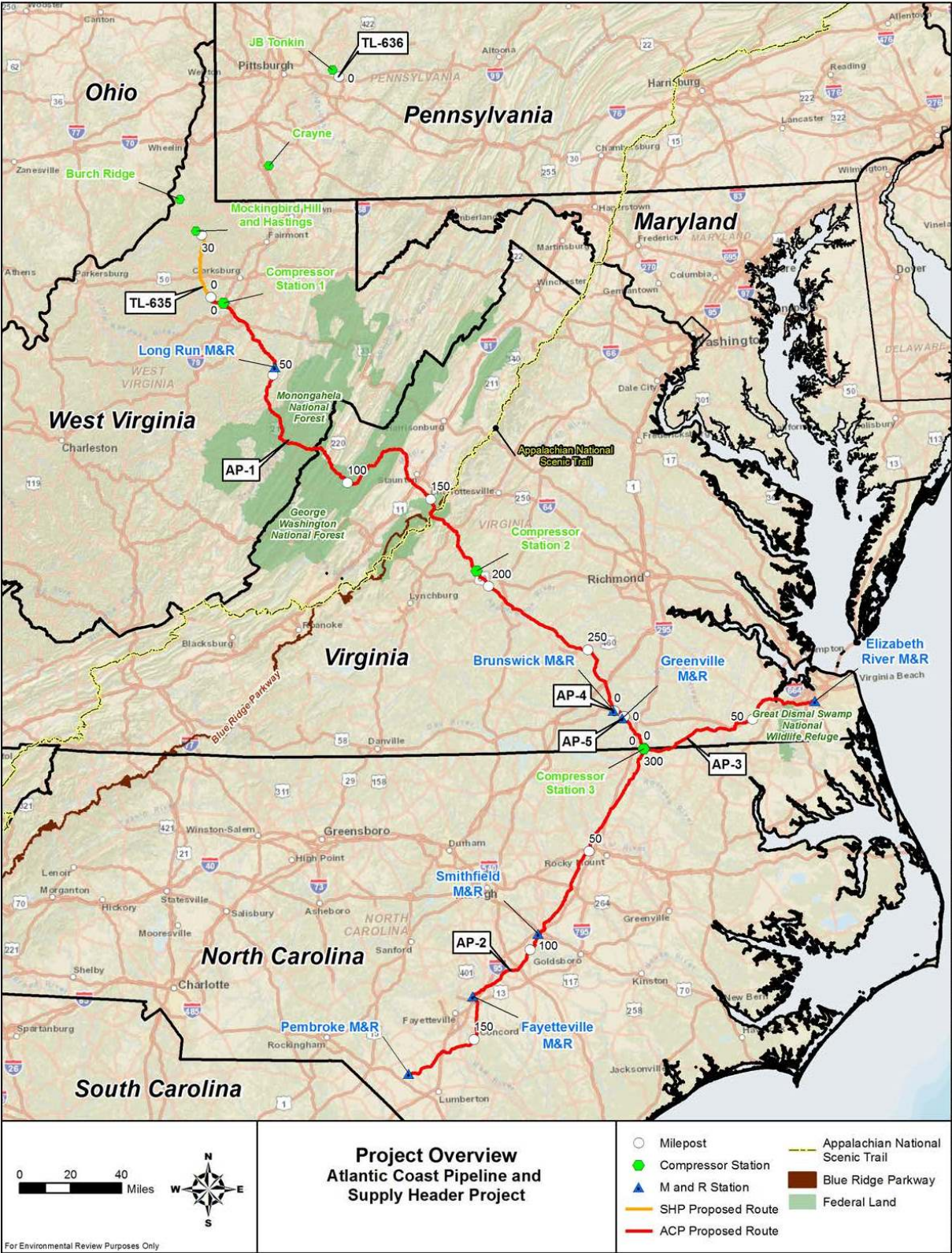
Figure 1. ACP and SHP project overview.