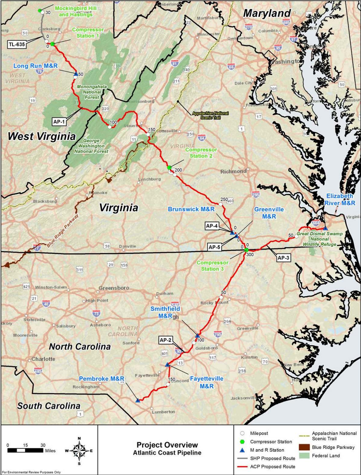
Figure 2. ACP project overview.