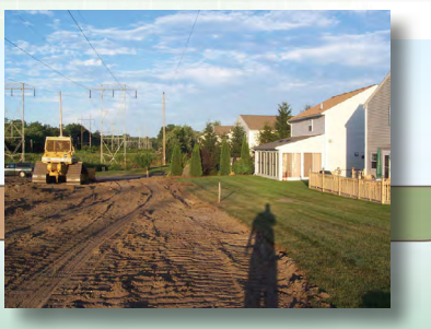
Restoring residential area