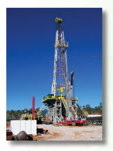
Well drilling rig

A: Possibly nothing, since the storage field itself is usually thousands of feet beneath the ground surface. Wells are needed to inject and withdraw the stored natural gas or to monitor field conditions (observation wells). The wells require a surface site of roughly one acre for drilling and less than one tenth of an acre for the surface wellhead piping and other facilities.