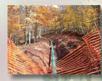
Pipeline in trench