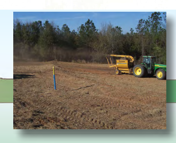
Reseeding the right-of-way