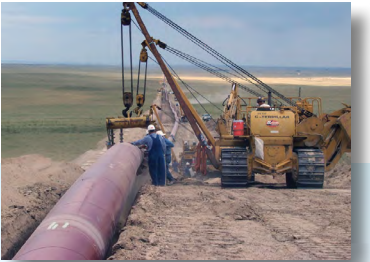
X-ray and weld repair