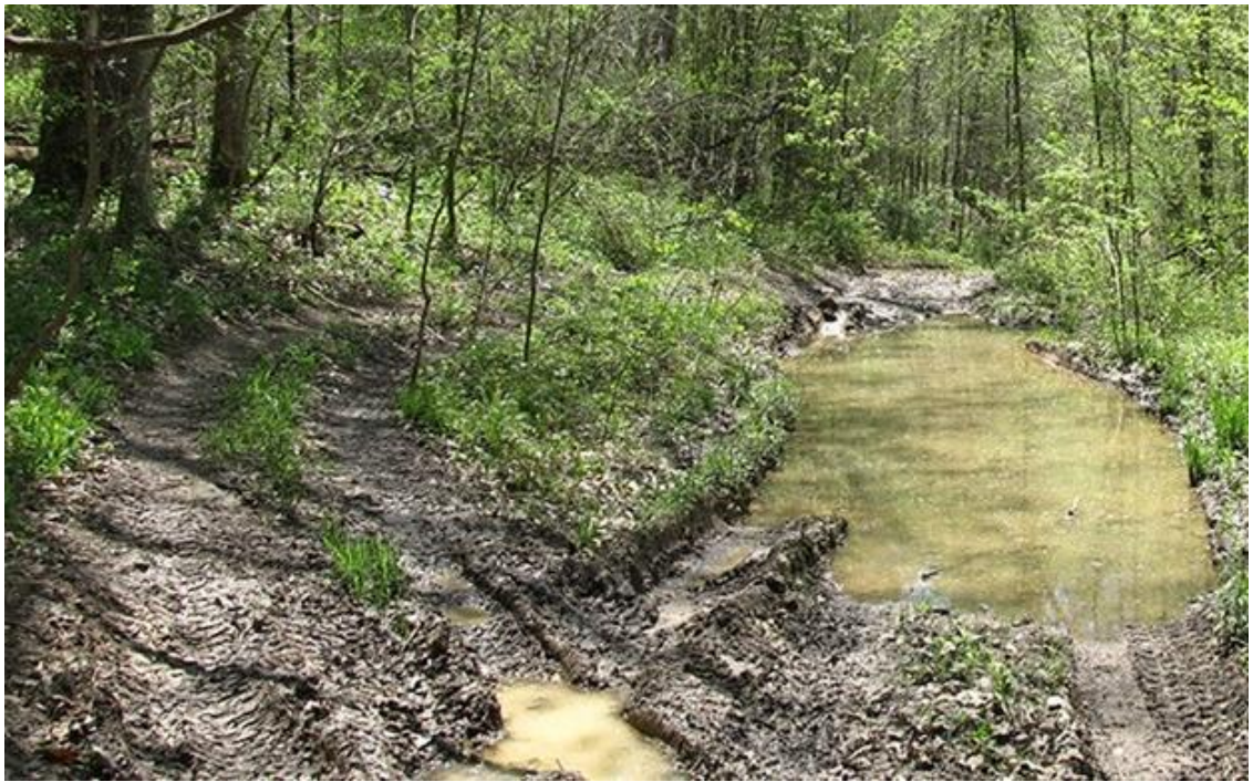
Example of damage caused by illegal ORV use on National Forest lands.

A new project added this week to ABRA's Conservation Hub highlights the growing threat off-road-vehicles (ORVs) pose to the environmental integrity of public lands. Sponsored by the West Virginia Highlands Conservancy, the project includes an interactive online map to help educate the public and legislators regarding the impacts on West Virginia's public lands. The <u>project's web page</u> points out that "there are universal effects and severe environmental impacts on many fronts" if ORVs are permitted to operate on public lands, citing a <u>comprehensive study on the issue conducted by the U.S. Geological Survey</u> (USGS). The USGS study discusses the negative impacts that often result from ORVs being permitted to be used on public lands, including effects on soils, vegetation, wildlife habitats and water quality.