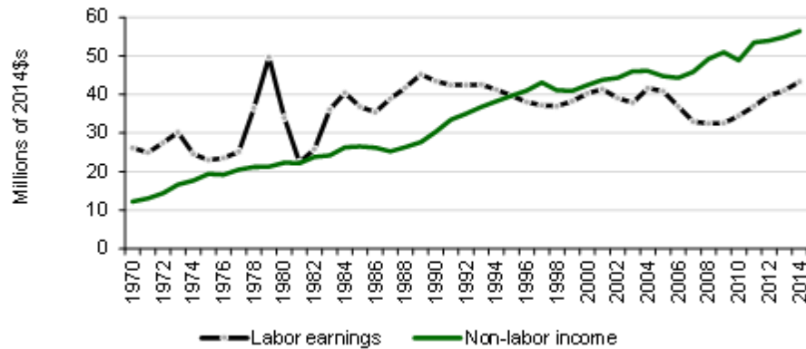
Figure 2: Components of Personal Income, Highland County

Besides labor income (one’s earnings from a wage-and-salary job), Highland residents also receive “non-labor income” in the form of earnings on investments (dividends, interest, and rent) and transfer payments, such as Social Security and Medicare. As a share of the total non-labor income now accounts for 57 out of every 100 dollars earned or received by Highland residents. This is nearly double the percentage from 1970. Since 2000, non-labor income rose 33.0% while labor earnings rose by only 7.6% (Figure 2).