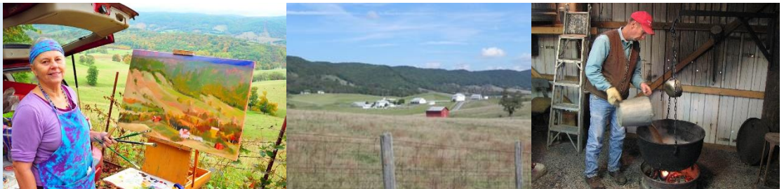
Left to Right: Artists’ Weekend; Dividing Waters Farm; Maple Festival

In Highland County, known as “Virginia’s Switzerland” for its high mountain valleys, scenic beauty, and rural charm, residents depend on a clean and healthy environment to sustain a high quality of life. The Atlantic Coast Pipeline, which would run 25.5 miles in Highland, has triggered widespread concern over what the pipeline would do to the local community, land, and economy. This report describes the assets and conditions that may be at risk if the Atlantic Coast Pipeline were built and summarizes research on the potential economic impacts on land value, natural benefits, and key economic sectors in Highland County.