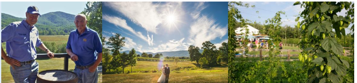
Left to Right: Bold Rock Cidery; Veritas Winery; Blue Mountain Brewery

Nelson County has a robust and growing economy thanks in part to its clean and healthy environment and high quality of life. As a destination outdoor recreation area, residents depend on a clean and healthy environment to sustain a high quality of life. The Atlantic Coast Pipeline, which would run 26.1 miles in Nelson, has triggered widespread concern over what the pipeline would do to the local community, land, and economy. This report describes the assets and trends that may be at risk if the Atlantic Coast Pipeline were built and summarizes research on the potential economic impacts on land value, natural benefits, and key economic sectors in Nelson County.